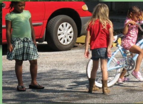
Children play and ride bikes safely in front of their apartments. Down the street are the lake and nature trail.