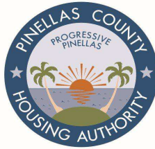
EXHIBIT 14-2: PINELLAS COUNTY HOUSING AUTHORITY GRIEVANCE PROCEDURE