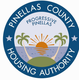
EXHIBIT 11-2: PINELLAS COUNTY HOUSING AUTHORITY (PCHA) COMMUNITY SERVICE AND SELF-SUFFICIENCY POLICY