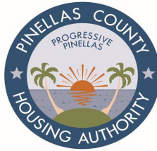
EXHIBIT 14-2: PINELLAS COUNTY HOUSING AUTHORITY GRIEVANCE PROCEDURE