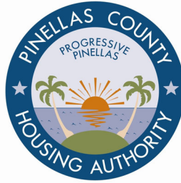
EXHIBIT 11-2: PINELLAS COUNTY HOUSING AUTHORITY (PCHA) COMMUNITY SERVICE AND SELF-SUFFICIENCY POLICY